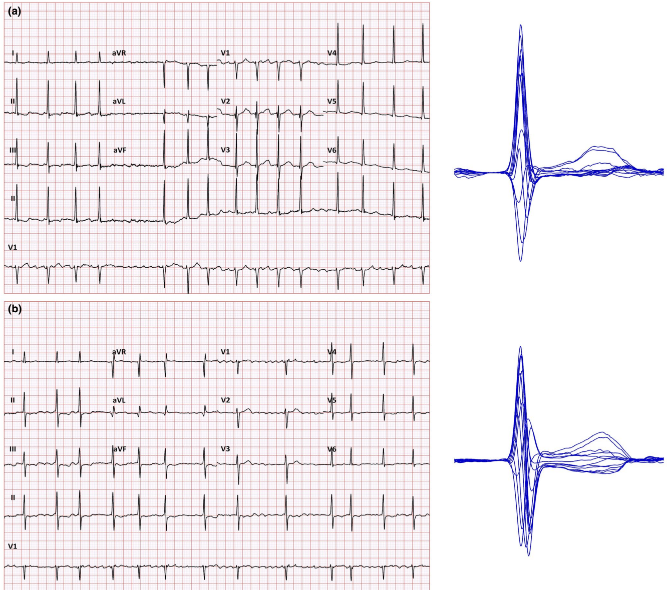
FIGURE 2 Digital 12-lead ECGs recorded in patients with atrial fibrillation (a—67-year-old female, b—70-year-old male). In both cases, any reasonably accurate QT interval measurement is clearly difficult if not impossible in the standard 12-lead printouts shown on the left-hand side. (Note that while T waves are visible in some of the precordial leads of both tracings, their morphology in individual beats is influenced by atrial fibrillatory waves which make the QT interval measurement inconsistent between individual cycles.) On the right-hand side, corresponding representative complexes are shown constructed with automatic determination of the QRS onset and superimposition of the segments preceding the QRS complex in all leads. While some noise due to the fibrillatory waves is still visible in the representative beatforms, QT interval duration can be made with sufficient confidence in both cases

However, since the algorithms used in the commercial equipment are steadily advancing (Green et al., 2012) their clinical reliability is now probably at least equivalent to fully manual measurements especially if combined with visual verifications to eliminate occasional outliers (Hnatkova et al., 2006).