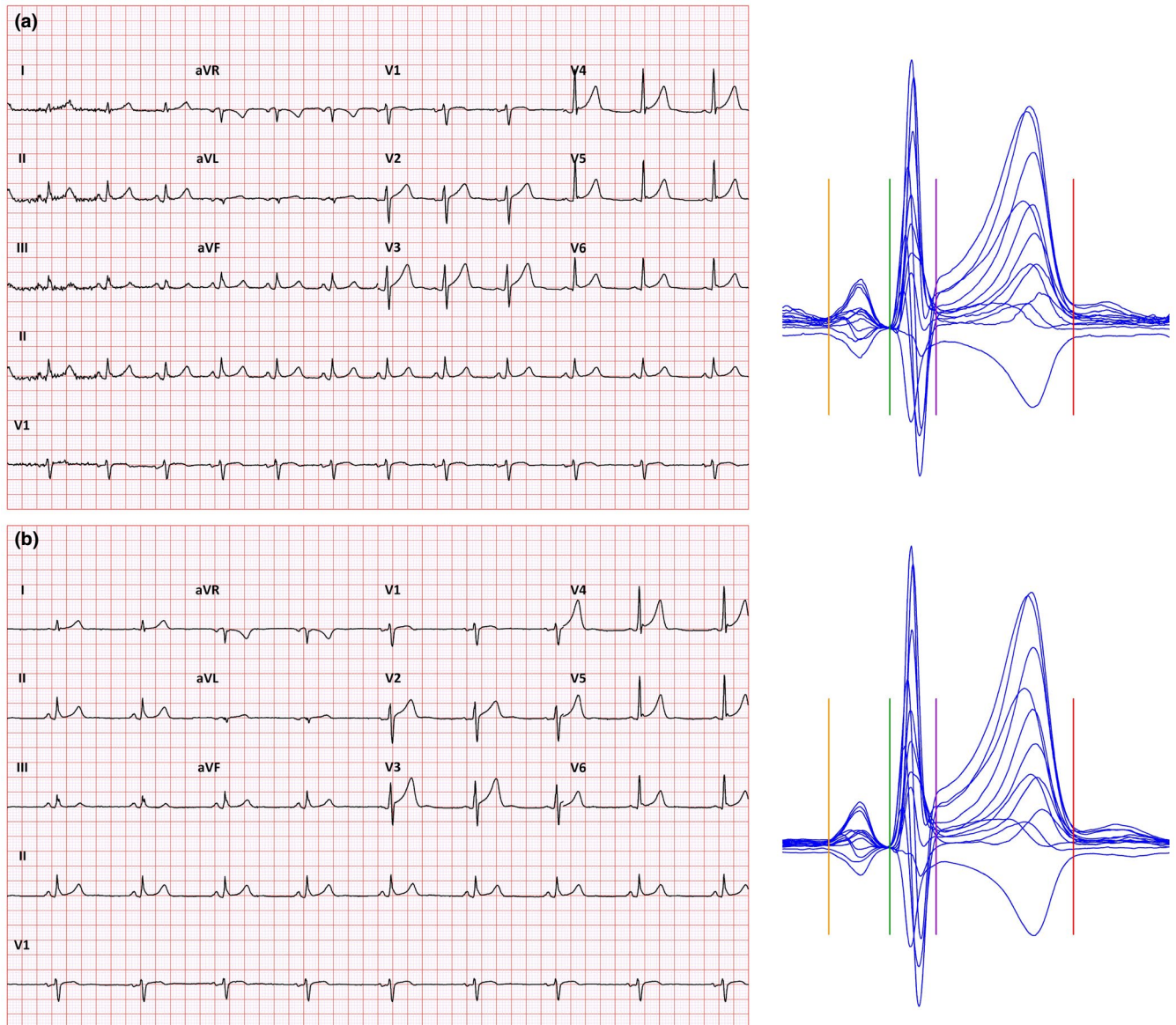
FIGURE 4 Digital 12-lead ECGs recorded in a 45-year-old healthy male off any medication. The recording shown on the top started 20 s before the recording B shown on the bottom. The averaged 10-s heart rates were 73.5 and 53.4 beats per min in recordings a and b, respectively. The images of representative beats of all 12 leads superimposed on the same isoelectric axis are shown on the right side of each panel. These also show the measurement triggers of P onset (amber line), QRS onset (green line), J point (violet line), and T offset (red line). The uncorrected QT interval in both tracings was the same (428 ms). When using the 10-s heart rate and correcting the QT interval by Bazett correction, QTc intervals of 474 and 403 ms were obtained. With Fridericia correction, the QTc values were 458 and 411 ms. When using individual correction that also involved individual QT/RR hysteresis component, QTc values of 417 and 419 ms were obtained

profile in a given patient (i.e., it is impossible to guess whether a QT-heart rate profile of a given patient is closer to case A or to case B in Figure 3). Hence, if ECGs before and after treatment are compared and if they noticeably differ in heart rate, it is practically impossible to say whether the QT interval was changed by the drug above or below the level that could be attributed to the heart rate change in the given patient (Malik et al., 2019).