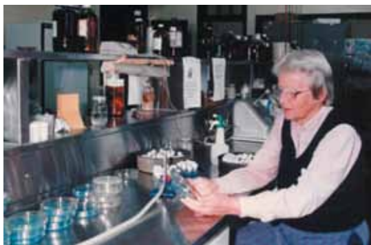
Figure 2. The Brazilian scientist Professor Johanna Döbereiner (1924–2000) who discovered Gluconacetobacter diazotrophicus in sugarcane in Alagoas, Brazil, jointly with Vladimir Cavalcante.

a portal of entry large enough for bacterial penetration, becoming intracellular via endocytosis into membrane-bound nitrogen-fixing symbiosomes. Rhizobia are then trapped inside nodule cells and are unable to become systemic in the crop, and hence are unable to utilize the cells of the root, stem and leaves outside of the nodule as a habitat for symbiotic nitrogen fixation. Other endophytic microorganisms are more versatile. In the leaf glands of the non-legume garden plant Gunnera the nitrogen-fixing cyanobacterium Nostoc establishes intracellular symbiotic nitrogen fixation without any nodule formation; and in the intracellular root symbioses of legumes and non-legumes, including cereals, with phosphate-acquiring arbuscular mycorrhizal fungi there is no nodulation. Establishing symbiotic nitrogen fixation in crops, without nodulation, will require not only extensive systemic intracellular colonization by diazotrophic bacteria but also the protection of their nitrogenases from inactivation by oxygen. For instance, the nitrogenase complex of rhizobia is readily inhibited by oxygen, and rhizobia are now regarded as being unable to establish symbiotic nitrogen fixation in non-legume crops; regulating the flux of oxygen to endosymbiotic rhizobia has been suggested to be an insuperable challenge to the dream of effectively introducing rhizobial nitrogen-fixing symbiosis into non-legume crops.