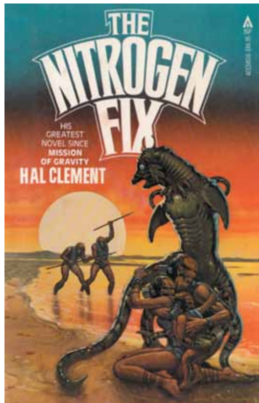
Figure 1. The Nitrogen Fix The front cover illustration by David B. Mattingly of a novel of the ultimate ecological disaster (Reproduced with permission).