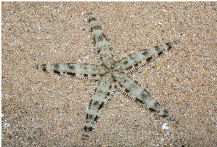
Figure 3. Archaster typicus [31].

Archaster typicus (Müller & Troschel, 1840) is distributed in the shallow waters of the Western Indian Ocean and the Indo-Pacific. Also known as a sand star, it has five long, slightly tapering arms with pointed tips [30]. It has usually a grey or brownish colour, variously marked with darker and lighter patches (Figure 3).