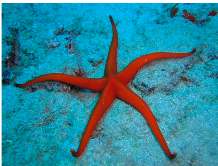
Figure 16. Narcissia canariensis [89]

Narcissia canariensis (d'Orbigny, 1839) is a five-armed starfish characterized by an even orange colour with a yellow tip at the end of each arm (Figure 16). This species is widely distributed in the Canaries, but it also inhabits the areas of Cape Verde, the Gulf of Mexico, Madeira, the Azores and the Congo.