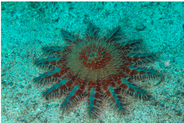
Figure 1. Acanthaster planci [19].

The crude extract of A. planci was tested against human breast cancer MCF-7 cell line by Mutee et al. [20]. The study demonstrated that the extract has potent cytotoxic as well as apoptotic effects on human breast cancer MCF-7 cell lines compared to tamoxifen. Thus, the results suggested that the extract of A. planci starfish, given its strong cytotoxic effect, could be employed as a chemotherapeutic agent in the treatment of breast cancer. Lee et al. [21] in their study extracted a protein toxin from venom of the crown-of-thorns starfish Acanthaster planci (Crown-of-thorns Acanthaster planci Venom, CAV), the structure of which was identified as plancitoxin protein. The cytotoxic activity against five cell lines was investigated and the results showed that CAV has an anti-proliferative effect on all cell lines, but in particular on human malignant melanoma A375.S2 cells. Investigations about the mechanism of action suggested that CAV reduce cell viability by inducing apoptotic events, which are mediated by mitochondrial membrane and p38 pathways. Moreover, plancitoxin I inhibits the proliferation of A375.S2 cells by inducing oxidative stress, mitochondrial dysfunction and Endoplasmic Reticulum stress-associated apoptosis [22].