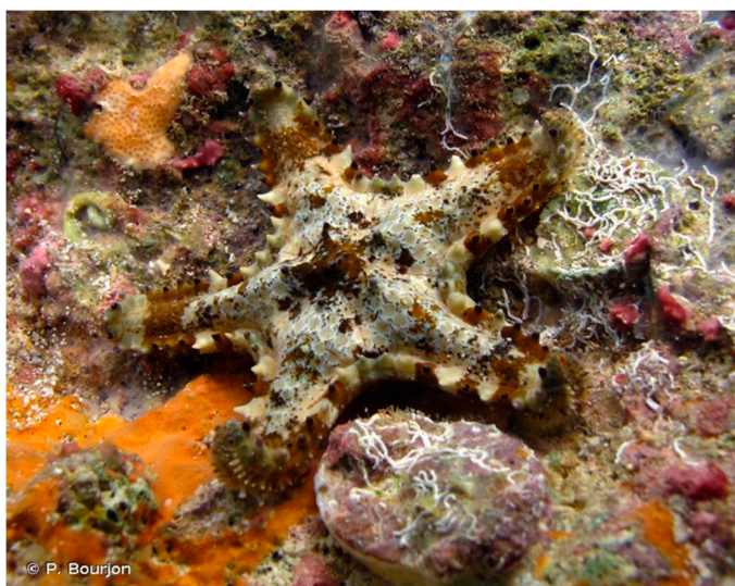
Figure 6. Asteropsis carinifera [49].

The starfish Asteropsis carinifera (Lamarck, 1816) is distributed in the Indo-Pacific area. It has five arms characterized by the presence of large conical and dull spines aligned in the middle and on the periphery of each arm. The body is relatively flat but slightly convex towards the middle of the central disk and the colour is usually gray with stained brown spots (Figure 6).