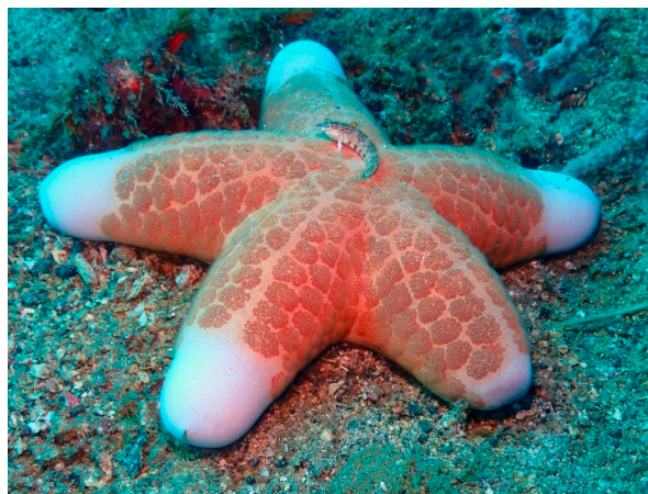
Figure 9. Choriaster granulatus [64]. © Mark & Marta Bockstael-Rubio ( https://www.jungledragon.com ).

Choriaster granulatus (Lütken, 1869) habits the Indo-West Pacific waters (Figure 9). It is found in sandy zones, among corals and sponges and feeds on coral polyps and other small invertebrates. This starfish has a large convex body with five short arms. It has a typical pale pink color characterized by brown papillae in the center.