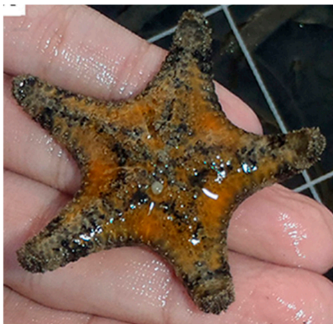
Figure 2. Anthenea aspera [28].

In a further study [14] the isolation of new steroidal glycosides from the starfish Anthenea aspera (Döderlein, 1915) was carried out (Figure 2), and their in vitro effects on colony formation, cell viability, and apoptosis promotion in three different types of human tumor cell lines, i.e., human melanoma RPMI-7951, breast adenocarcinoma T-47D and colorectal carcinoma HT-29, were evaluated. All the tested compounds showed inhibitory effect on colony formation at nontoxic concentration in the three cell lines. Furthermore, the mixture of two molecules (anthenosides J and K) showed a significant anticancer effect through the induction of apoptosis. Indeed, these compounds cause the downregulation of anti-apoptotic protein expression (Bcl-XL) and the up-regulation of the pro-apoptotic protein expression (Bax and Bak), leading to the activation of the initiator caspase-9 and, in turn, of the effector caspase-3.