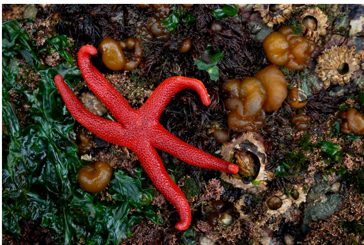
Figure 14. Henricia leviuscula [81].

Henricia leviuscula (Stimpson, 1857), commonly known as the Pacific blood star, is a starfish that habits the Pacific coast of North America. It has a brilliant red-orange color and five, long, tapering arms, characterized by the absence of pedicellariae and spines (Figure 14).