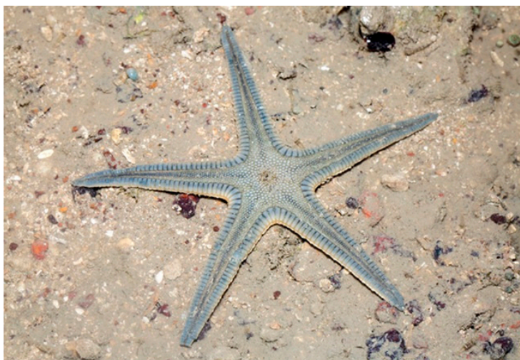
Figure 10. Craspidaster Hesperus [67].

Craspidaster hesperus (Muller & Troschel, 1840) (Figure 10) is distributed in the Indo-West Pacific Ocean. It is a flat sea star with five elegant tapered arms. The dorsal surface of its body presents special flat-topped, pillar-like structures, called paxillae. Large marginal plates characterize the body's edges and the tube feet are pointed [66].