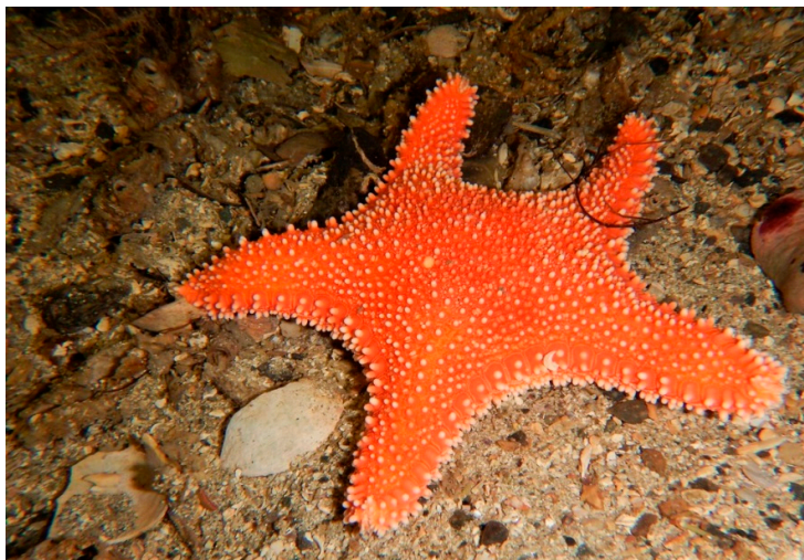
Figure 15. Hippasteria phrygiana [83].

Kicha et al. [84] isolated four new asterosaponins, Hippasteriosides A–D, from the alcoholic extract of the Far Eastern starfish H. kurilensis . The structures of the compounds were characterized and their cytotoxic activity was evaluated against human colon tumor HT-29 cells. All the compounds did not show a significant effect on cell growth within a 15–120 mg·ml -1 concentration range. However, Hippasterioside D at non-cytotoxic concentration (60 mg·ml -1 ) was able to reduce both colony number and size if compared with non-treated cells, while Hippasteriosides A and B exhibited a less pronounced potential than hippasterioside D in inhibiting cell transformation. Hippasterioside C failed to demonstrate any significant effect on HT-29 cells. Thus, Hippasterioside D seems promising for further investigation as an anticancer agent.