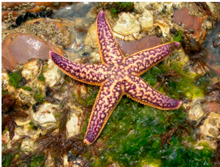
Figure 4. Asterias amurensis [34].

Lei et al. [35] examined the anti-tumor activity of cerebrosides derived from the sea cucumber Acaudina molpadioides (AMC) and the starfish Asterias amurensis (AAC), both in vitro and in vivo. Cerebrosides are one of the simplest classes of glycosphingolipids that are widely present in the plasma membranes of fungi, plants and marine organism. They are characterized by monosaccharides, an amide-linked fatty acid and a sphingoid base commonly named long-chain base [36] and in several studies they showed to play a series of biological roles [37–39]. In particular, these molecules were tested in vitro against murine sarcoma cells (S180) and the results obtained demonstrated a dose-dependent inhibitory effect of AAC-derived cerebrosides on cell proliferation, which appears stronger and more efficient than that of AMC-derived ones. Further investigations revealed that this restraining effect occurs through the mitochondria-mediated apoptosis pathway, via the downregulation of Bcl-2 and Bcl-XL expression and the up-regulation of Bax, Cytochrome c, caspase-9 and caspase-3 expression. In addition, a significant reduction of tumor growth was obtained in vivo by treating S180 tumor-bearing mice, although in this case AAC-derived cerebrosides were less potent than AMC-derived ones.