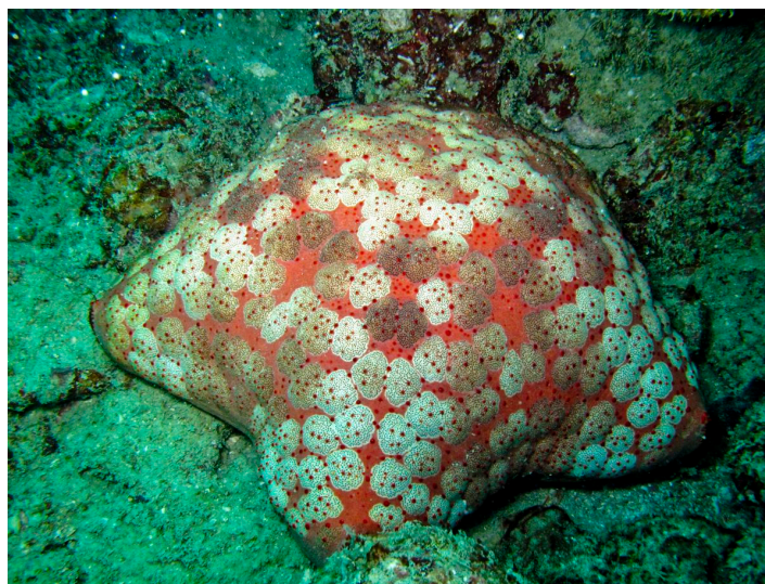
Figure 12. Culcita novaeguineae [71].

Culcita novaeguineae (Müller & Troschel, 1842), commonly known as pin cushion star, is pentagonal in shape, with short arms and an inflated appearance (Figure 12). The ventral side presents a central mouth and rows of tube feet. C. novaeguineae is characterized by variable colours, and it usually habits the coral reefs of the warm water in the Indo-Pacific Ocean.