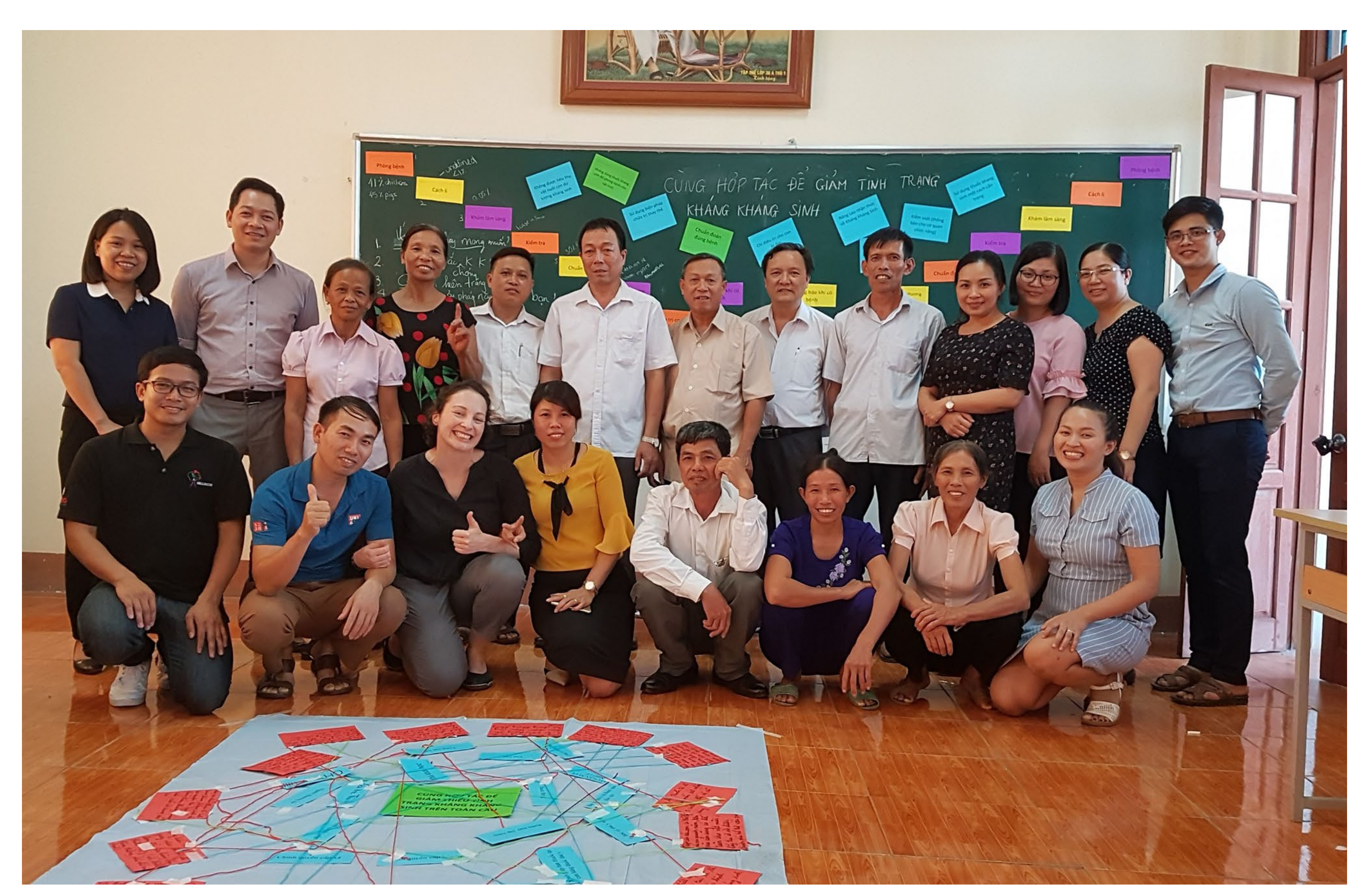
Figure 1: Participatory group interviews proportionally mapped cases of 'sick pigs' from the point of case recognition to treatment, identifying key stakeholders and themes for further investigation