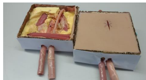
Figure 1. Section and full views of the multi-layer pad.

The surgery is performed on the anatomic pad using real tools and provides realistic feedback of the passive behaviour from the different anatomic structures. Active behaviour such as cardiac pulse or muscular contractions caused by local nerve stimulation are also simulated.