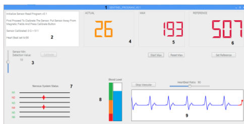
Figure 3. First version of SENTISIM user interface.

The software (virtual part of the system) collects all the data from the sensors, guides the exercise through a user interface which displays the counting of the detection probe along with its reference value and other information such as like heart beat signal, vascular circuit blood level and nerve integrity (Fig. 3). Once finished the exercise, the software evaluates the training session through performance data. Gathering information of the training and comparing over evaluation metrics is essential to measure the quality of an exercise. The evaluation metrics considers time, precision of detection, probe sweeping area, correct node extraction and accidents (vessel or nerve cut). This evaluation is combined with an ocular inspection from a supervisor.