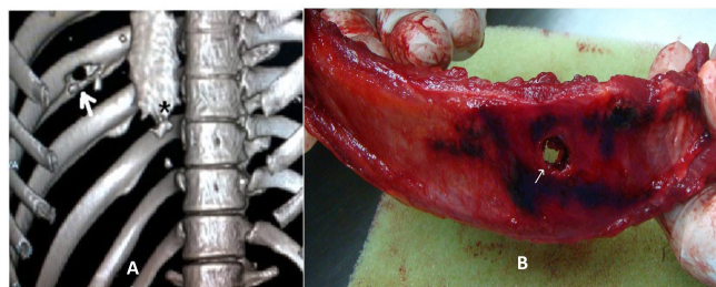
Figure 2: A - Volume rendering image of the thoracic cage demonstrating an entrance hole with characteristic internal beveling at the right 8th posterior rib (arrow) and a jagged fracture of exit wound at the right side of the xiphisternum (asterisk). B - The deadly hole of entrance wound in the right 8th posterior rib (arrow) on autopsy specimen.

irregular open wound with multiple small air pockets was observed at the subcutaneous tissue of the anterior chest wall in the midline (Fig.3A). Lung window of the same PMCT demonstrated right haemopneumothorax with adjacent lung atelectasis. The pneumothorax appeared to be in continuity with the pneumopericardium (Fig.3A). There were evidence of bony fragments with CT density of 200-315 HU scattered at the collapsed superior segment of the right lower lobe which followed the direction of the projectile (Fig.3B). There was also discontinuity of the right ventricular muscle suggesting right ventricular laceration (Fig.4B). The PMCT findings (Fig.4A) were compared with those of conventional autopsy and found to be compatible. No abnormality