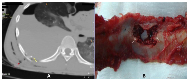
Figure 1: A - Lung window of axial PMCT showing soft tissue injury with air pockets in the posterior right chest wall and a linear track of gas (dotted arrow) associated with internal beveling at the fractured rib (solid arrow) represent the direction of gunshot entrance. B - Autopsy specimen viewed from internal aspect of the rib demonstrating internal beveling (arrows) compatible with the one on PMCT.