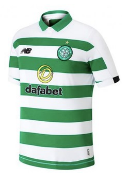
Celtic's 2019-20 shirt.

We assessed how often references to a gambling company appeared, where these references appeared (such as pitchside advertising), and what they looked like (for example, on match shirts). It repeated our previous work exploring alcohol marketing at the UEFA Euro 2016 football tournament.