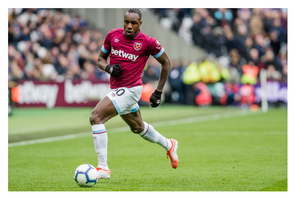
Half the teams in the English Premier League –like West Ham – are sponsored by gambling companies.