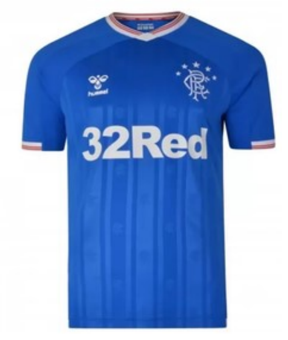
Rangers' 2019-20 shirt.

Other clubs such as English amateur side Headingly FC and Lewes Community Football Club have agreed to wear the Gambling With Lives logo on their shirts to warn about the dangers of gambling addiction.