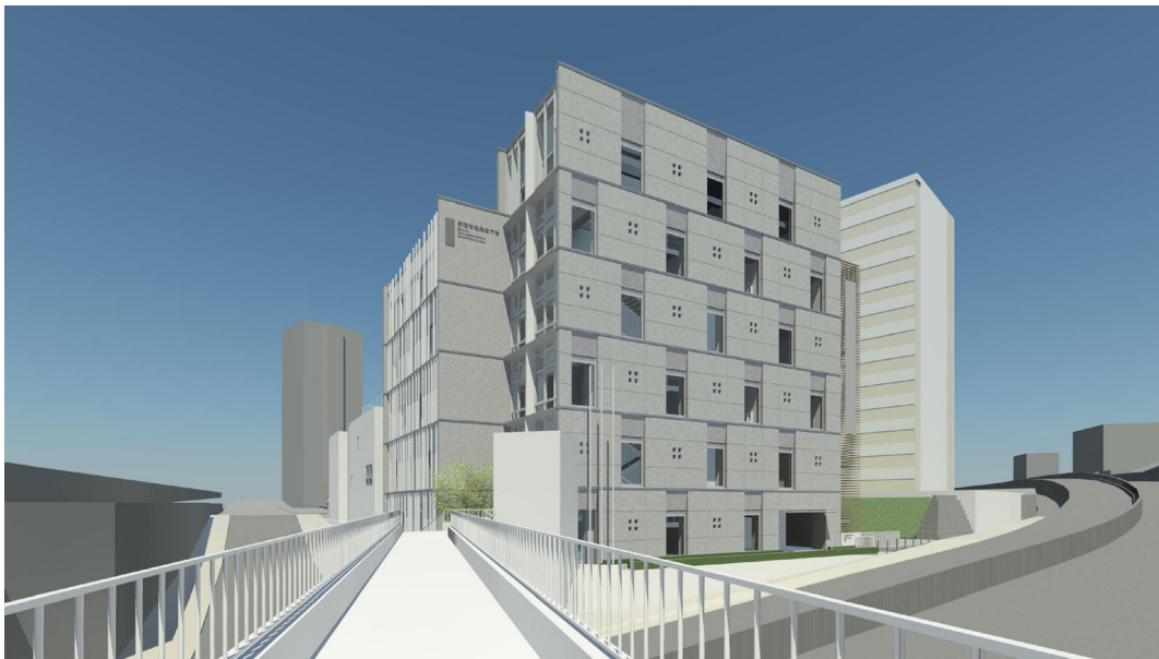
Fig. 1 Shinjuku Labors Federal Office Building (Government Building Department, 2014b)

The “New Sukagawa City Hall”, located in Fukushima Prefecture, is an example of a BIM implementation project by a local government 1) (Fig.4). AXS Satow, Inc., won the design proposal. The engineer of Satow said, “As a condition of the design contract, Sukagawa City asked us to use BIM as an advanced case of a building project to provide high accuracy and consistency in architectural design as well as to share the design contents with public citizens. Of course, BIM was implemented not only during the design phase but also in the construction phase and after the completion for facility management 2) .”