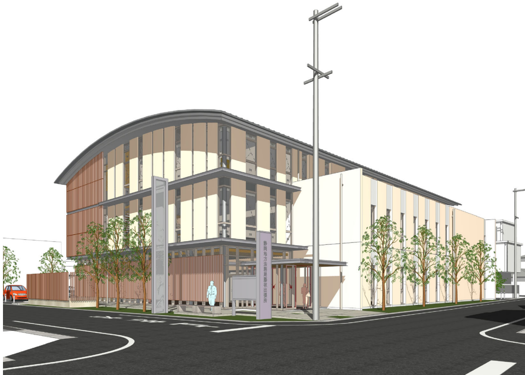
Fig. 2 Shizuoka Regional Legal Office Fujieda Branch (Government Building Department, 2014c)