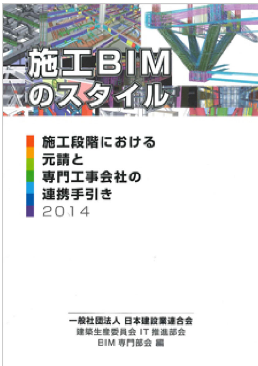
Fig. 6 Guideline for Collaboration between General Contractors and Subcontractors ( http://www.nikkenren.com/publication/detail.html?ci=200 )

The leading clients in Japan have shown interest in BIM in anticipation of using BIM in facility management. Case studies of facilities management in universities and factories have been already reported. BIM for only the completion of design documents is not the goal; the operational situation of buildings should also be reflected and added to the BIM. In addition, tools for simple input by 3D scanning existing buildings into BIM are required.