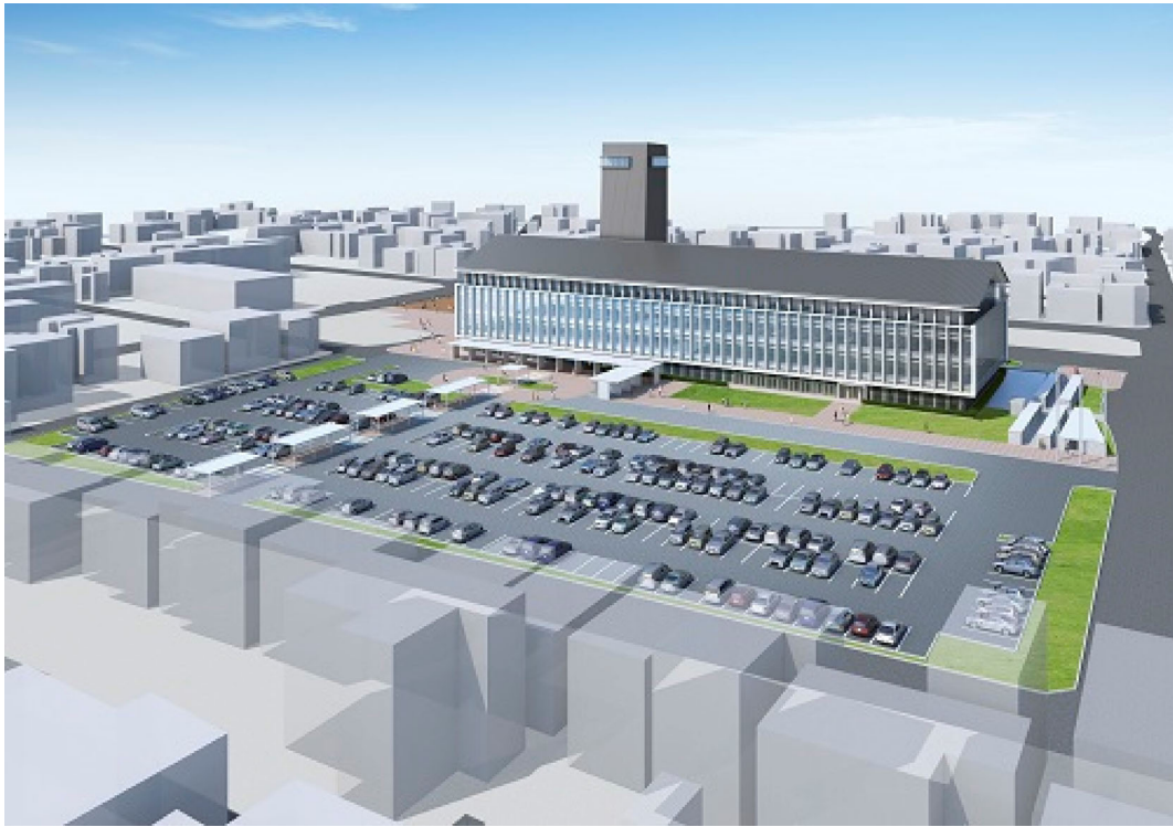
Fig. 4 New Sukagawa City Hall ( http://www.city.sukagawa.fukushima.jp/6220.htm )

The concept design of this project started in November 2012, and the development design ended in March 2014. Construction was started in autumn of 2014, and it was planned to be finished in March 2015 but delayed to March 2017. This was because of the complex construction plan of the mixed structure and the procurement of the labor and materials 1) .