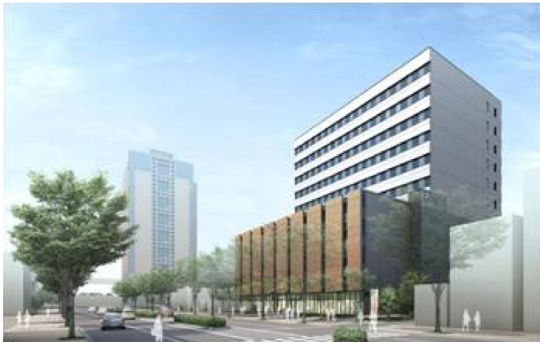
Fig. 3 Maebashi Regional Federal Office (Building Government Building Department, 2014d)