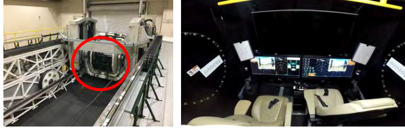
Figure 1. Disorientation Research Device