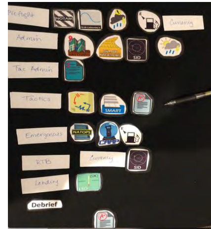
Figure 2. An example icon grouping.

Four of the SMEs created groups of apps that centered around three main types of pilot activity: the tactical mission, navigation and administrative work, and non-normal or emergency conditions. Table 1 displays a specific grouping created by the fifth SME, who introduced the idea of first and second tier applications within a major activity category. This adds another layer of organization on top of the situation-specific groupings in which apps are organized solely by pilot goal or activity set.