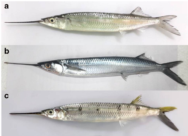
Fig. 2 Fresh specimens of three species of the genus Hemiramphus . a Hemiramphus archipelagicus , 195.7 mm SL, Puri North Landing Center, Odisha, India; b ) Hemiramphus lutkei , 210 mm SL, Tharuvaikulam Landing Center, Tamil Nadu, India; C ) Hemiramphus far , 238 mm SL, Astaranga Fishing Harbour, Odisha, India

Body elongated and slightly cylindrical. Dorsal profile rising slowly from the tip of snout to above the pectoral-fin insertion and thereafter parallel to the body axis to dorsal fin origin. Compared to the dorsal profile, ventral profile slightly arched from below the tip of the snout to the base of the caudal fin. Body width less than the body depth (62.1–62.3% in body depth). Lower jaw greatly prolonged into a beak-like structure (148.2–248.9% in HL), whereas upper jaw short (24.2–25.8% in HL), triangular in dorsal view and scale less. Pre-orbital ridge absent and nostrils with an oval-shaped nasal fossa. Both the jaw having dense, minute and conical teeth whereas tongue and vomer toothless. Body scales large, thin, cycloid and deciduous. Pectoral-fin short (17.2–18.4% in SL), not reaching past nasal pit when folded forward (length less than the distance between its origin to anterior margin of nasal fossa). Pelvic-fin also short and posterior to mid-body length. Dorsal and anal fins positioned posteriorly. Dorsal-fin lacks well developed anterior lobe. Caudal-fin deeply forked.