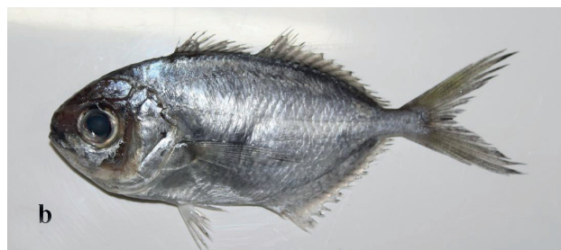
Fig. 1. A. brevimanum of 605 mm standard length (a) and A. indicum of 142 mm standard length (b) recorded from landings in Cochin Fisheries Harbour.