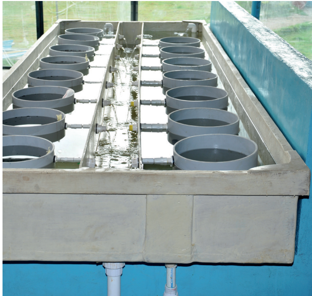
Fig. 4. Up-welling system

days and 17-20 mm on 60 days. On the other hand, spat reared in hatchery shows only limited growth and low stocking density. Seed grown in the micro-nursery nursery can be used for seeding ropes or used for on-bottom farm nurseries for further growth.