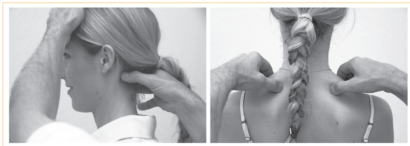
Fig. 1. Examination of neck reflex points (NRP): the C1 NRP region (left photo) and the C7 NRP region (right photo) are investigated for tenderness or pain by palpation. Details of the test performance are described in the Methods section, see also [7].

NRP can be detected by palpation at 6 different levels: the protuberantia occipitalis (NRP C0), the lateral edge of the vertical part of the trapezius muscle (NRP C1–C4), and at the middle of the horizontal part of the trapezius muscle