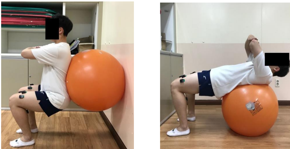
Figure 1. Traditional squat exercise (Lt.) and modified squat exercise (Rt.).

Method of the traditional squat exercise is as follows. The subject spreads his feet shoulder width apart and bends his knees into a 90° angle while maintaining equal weight bearing on their left and right lower extremities (Miyaji et al., 2012). With the sole of the feet staying planted on the floor, while in the standing position, the head of the femur moves to a point which is horizontal with the height of the knee then returns to the original position. To ensure that the upper body does not lean forward at this time, swiss ball is squeezed between the wall and the subject's back when the above exercise is performed (Figure 1).