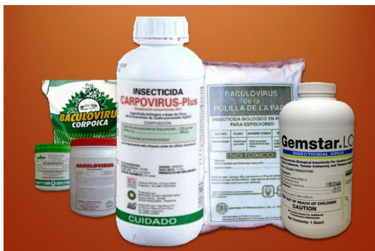
Figure 3. Some baculoviral pesticides commercialized in Latin America.

Note: the superscripts (1-19) are included for disambiguation in order to associate the biopesticide (product), the producer company and the country or countries where the particular biopesticides are applied. In particular, two products identified with the same designation, e.i. PTM baculovirus 16,17 are produced by different organizations in two different countries Peru 16 and Costa Rica 17 .