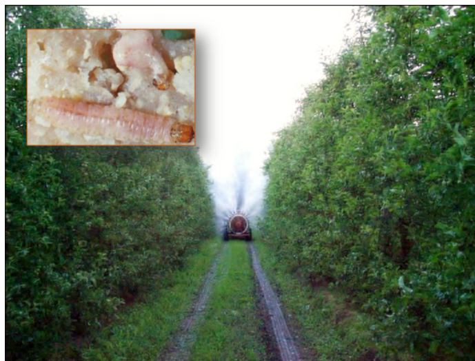
Figure 4. Application of Carpovirus Plus ® in apple orchards in Río Negro, Argentina. Inset: C. pomonella larvae infected by CpGV.

In organic production, with a 14 day interval between treatments, no detectable levels of damage were apparent at time of harvest, when the biopesticide was combined with a pheromone-based mating disruption technique. Annually, thousands of tons of fresh fruit treated with the virus enter the demanding international market [65,66]. The growing use of CpGV in walnut orchards impacted significantly on small farms in the valleys of Catamarca and La Rioja (Northwestern Argentina), where this safe and effective product doubled or even tripled the amount of fruit produced. The virus applications were performed every 10–12 days, with doses of 10^{13} OBs/hectare alone or in combination with conventional chemical insecticides, such as azinphos-methyl, lambda-cyhalothrin and cypermethrin [67,68].