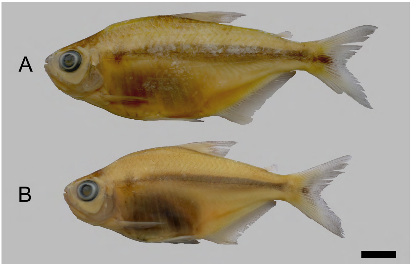
Figure 2. Astyanax dissensus , CI-FML 6183. A: Male, 81.3 mm SL. B: Female, 69.2 mm SL, from Uruguay River at Yapeyú, Corrientes, Argentina. Scale bar = 10 mm.

point to point with a caliper and are expressed as percentage of standard length (SL) or percentage of head length (HL). Morphometric measurements are provided in Table 1.