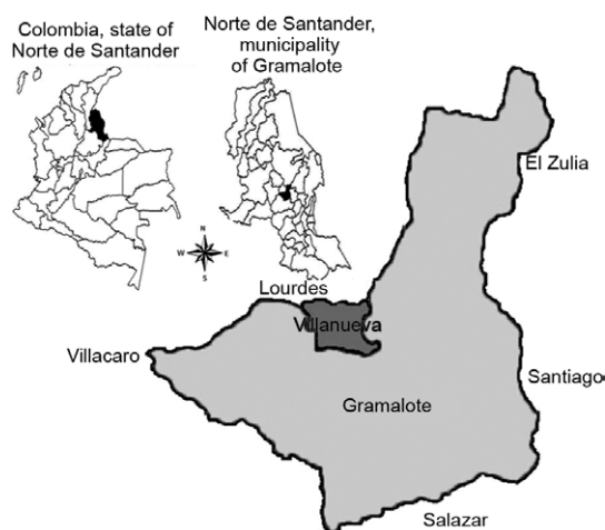
Fig. 1: study area: Villanueva, municipality of Gramalote, Norte de Santander, Colombia.

The frequency of Pi. spinicrassa collected with protected human bait was higher in the peridomicile area than in the intradomicile area ( p < 0.003 ), whereas the highest frequencies found for the automatic light trap (CDC) collections were observed in the intradomicile area ( p < 0.014 ). The highest Williams' average (11.5 insects/trap) was obtained for the forest, followed by the