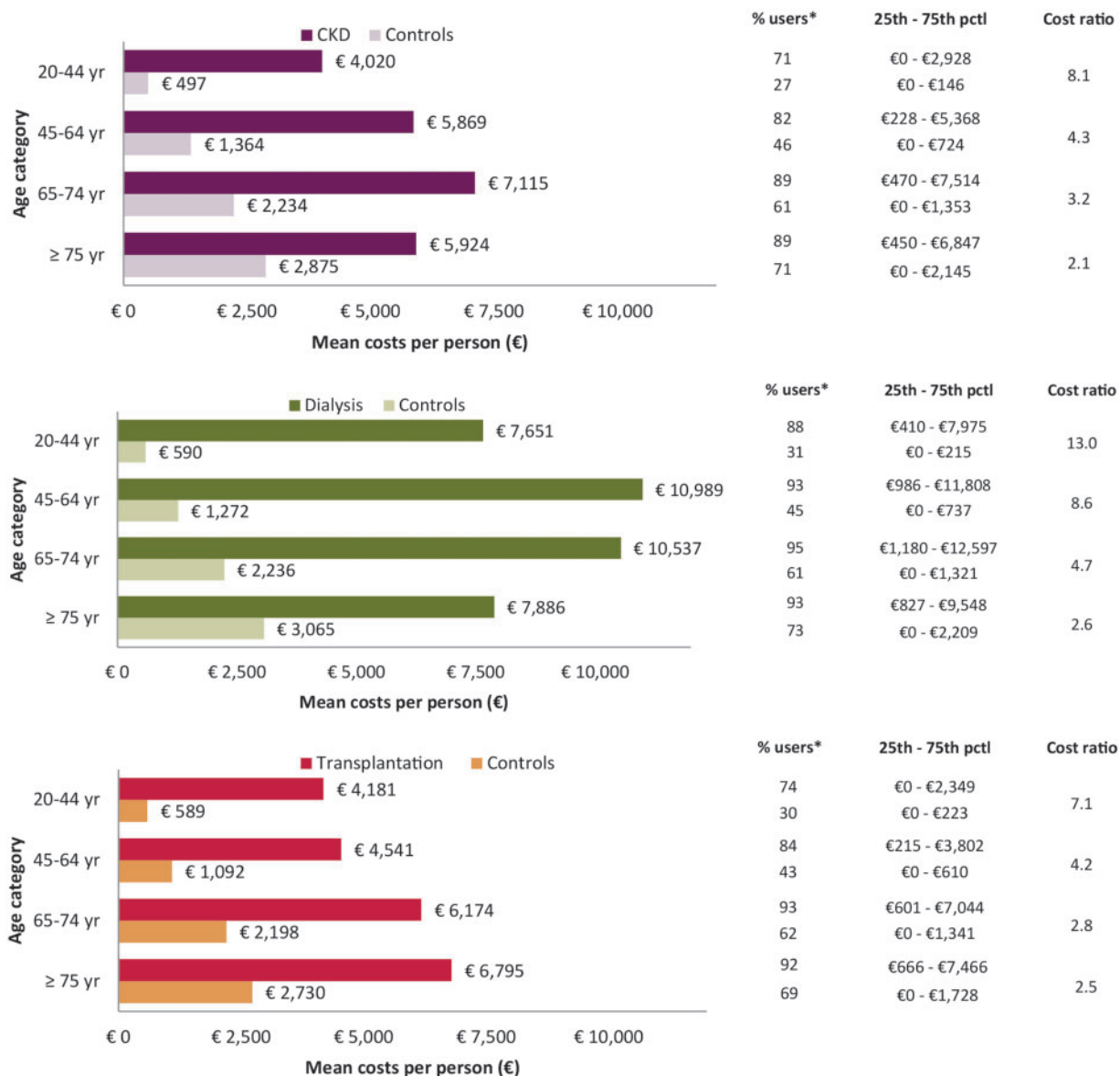
FIGURE 2: Hospital costs unrelated to treatment of CKD Stage G4/G5 not on RRT, dialysis and kidney transplant patients versus hospital costs of matched controls. *Denotes the percentage of users per group that incurred costs for care in that specific cost category.

categories or young and middle-aged patients were more costly than elderly patients. Of note, costs for CKD Stage G4/G5 and dialysis patients \geq 75 years of age were lower than for patients 65–74 years of age. We further demonstrated that young patients in particular incur considerably higher costs than controls, which is reflected by the decreasing cost ratios with age. Furthermore, we showed that renal patients were in greater need of additional specialist care because of kidney disease-related comorbidities. Although it is known that the burden of comorbidities is higher in elderly CKD patients, this study shows that costs related to comorbid illness in young patients is similar to that of elderly patients.