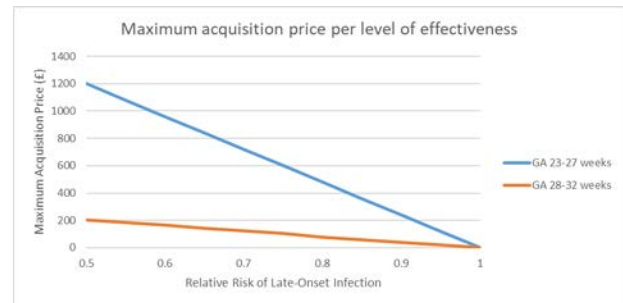
Figure 3 Maximum price by effectiveness level for a new hypothetical intervention. The graph represents, for each level of effectiveness, represented by the relative risk of LOI, the maximum price that could still make such a new hypothetical intervention cost-effective, at a cost-effectiveness threshold of £20 000/QALY. GA, gestational age; QALY, quality-adjusted life year.

Figure 3 shows the relationship between the maximum acquisition price of interventions to prevent LOI and their effectiveness,