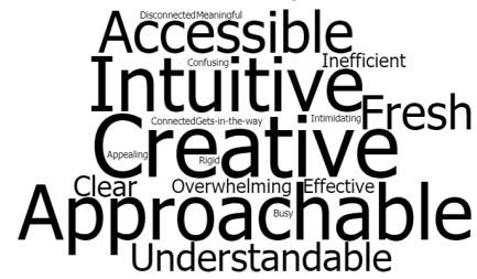
Figure 3: Wordcloud of all selected keywords

who's never used a mixing desk before". It was also suggested that this apparent affordance lent the use of CEQI to educational contexts.