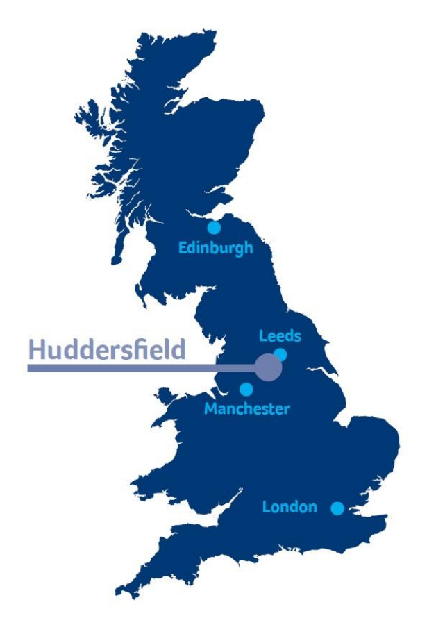
Figure 1: Map of UK showing location of University of Huddersfield