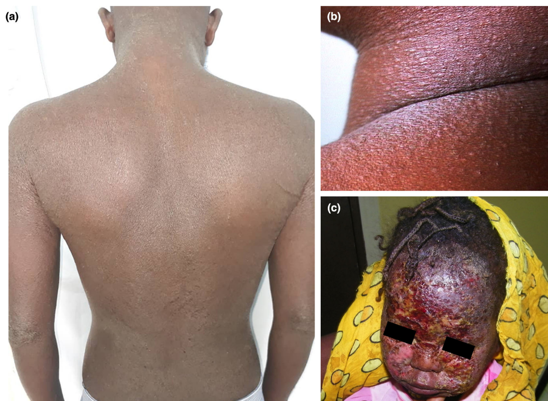
Figure 3 (a) erythroderma after herbal therapy, (b) papular AD and (c) severe bacterial superinfection in childhood AD.

The major differential diagnoses cited by participants besides contact eczema are scabies, insect bites, actinic lichen planus,