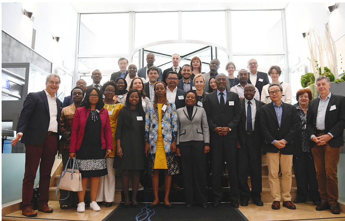
Figure 1 Group photo, Novotel Genève Centre.

'eczemas' in the WHO non-NTD chronic conditions list, which probably includes many cases of contact allergy and other eczematous conditions, remains a problem, compounded by the lack of validated diagnostic criteria for AD adapted to black African skin and environments. In addition to difficulties with diagnosis, barriers to the implementation of therapeutic education include, as for NTDs, poverty, inadequate facilities, shortage of skilled health workers, illiteracy, language and cultural barriers. The possibility of following an 'integrated' approach, as for NTDs, by better education of primary healthcare workers, including using digital technologies, may improve appropriate primary patient care and patient referral to specialists when necessary. 7