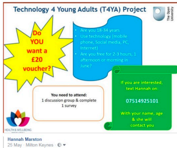
Figure 2. The amended poster and its deployment via Facebook for participant recruitment.

I'm still recruiting participants for this project that I'm running in the Pontefract Area. Focus Groups will be held from Monday 19th June (all week), mornings, afternoons & evenings (Tuesday & Thursday). If you or you know someone who is 18-34 years, free during the day or evening, & who either doesn't use or does use technology & want to get a £20 gift voucher for attending a focus group - Get in touch!!! Send me a text mgs on the number in the poster please.