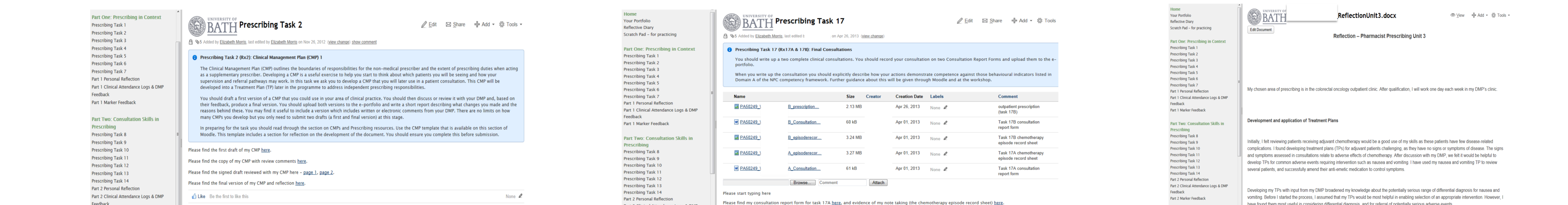
Figure 1: Sample wiki pages showing uploaded tasks, consultation reports and reflection.

The 2012 cohort of students were set up with bespoke wiki pages which mirrored the assessment tasks in the programme. Students completed practice based activities and uploaded evidence of these in the form of structured tasks, attendance logs and reflection. They also uploaded records of their required 90 hours of clinical practice and feedback from their designated medical practitioner (DMP). This work was assessed remotely by experienced markers and then peer reviewed by two members of the programme team. The students and markers were surveyed for their experiences of using the wiki. The programme team, together with the university e-Learning team, then evaluated the impact of this new process of assessment in addition to issues of digital literacy. Figure 1 shows sample pages from the wiki.