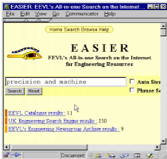
Figure 2 - EEVL's All-in-one Search Engine

Two harvested indexes and an archive of engineering newsgroups are available through EEVL [9, 10, 11]. To simplify its interface, EEVL is incorporating its various indexes into an All-in-one Search on the Internet for Engineering Resources which cross searches the various databases and returns search results on one page (Figure 2 illustrates a search for the terms precision and machine ).