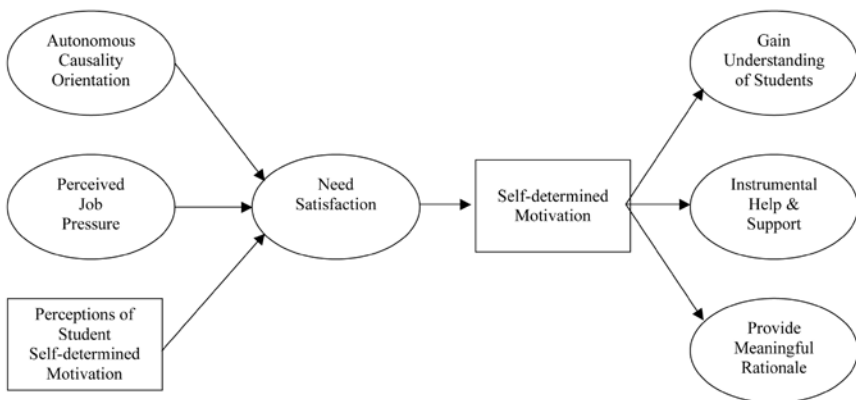
Figure 1 — Hypothesized model of antecedents of teacher motivational strategies in physical education. Note. The relationship between perceived job pressure to need satisfaction is hypothesized to be negative.

However, according to SDT, the social context should not influence motivational regulations directly as in the Pelletier et al. (2002) study; rather, the influence should be indirect via the satisfaction of three innate psychological needs (Deci & Ryan, 2000; Vallerand, 2001). These are the needs for autonomy, competence,