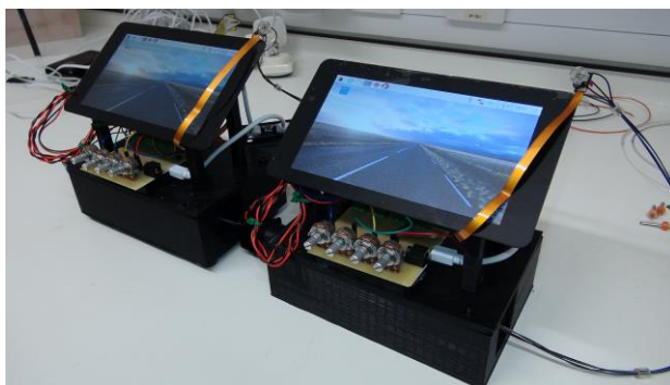
Fig. 2. Imaging System completely assembled and operational.