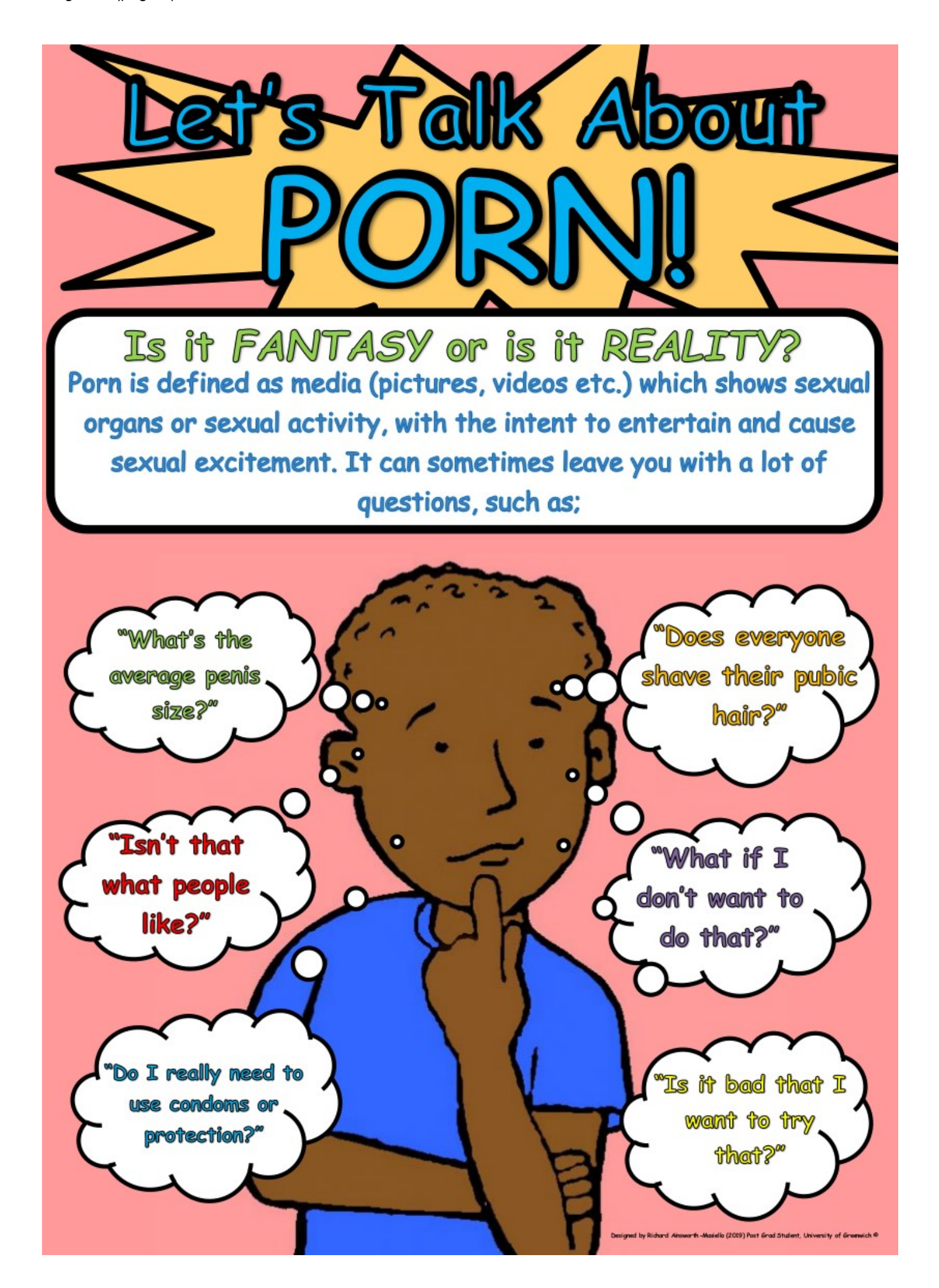
Figure 1 (page 1): Sexual Health Leaflet Resource created as a result of the Research