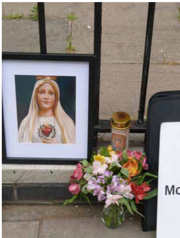
FIGURE 1. Pavement display in London, 2019

From the activists’ “life from conception”