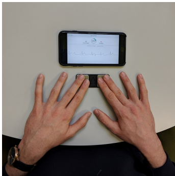
Figure 1: ECG monitor connected to the smartphone application.

Ethics. The experimental methodology used in this project adheres to the ethics regulations of the University of Edinburgh and the setup was reviewed and authorized by the School of Informatics Ethics Panel. All subjects signed a consent form, which confirmed their voluntary participation in the data collection procedure.