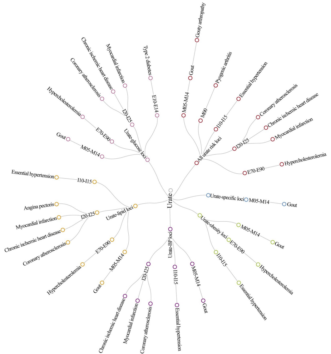
Fig 3. Network plot of the sensitivity analyses of PheWAS using different sets of weighted GRS. The red circles represent the disease outcomes associated with the weighted GRS of the 31 urate genetic risk loci; the blue circles represent disease outcomes associated with the weighted GRS of urate-specific risk loci; the green circles represent disease outcomes associated with urate-obesity pleiotropic loci; the orange circles represent disease outcomes associated with urate-lipid pleiotropic loci; and the pink circles represent disease outcomes associated with urate-lipid pleiotropic loci. E70-E90, metabolic disorders; GRS, genetic risk score; I10-I15, hypertensive diseases; I20-I25, ischemic heart diseases; M05-M14, inflammatory polyarthropathies; PheWAS, phenome-wide association study.

https://doi.org/10.1371/journal.pmed.1002937.g003