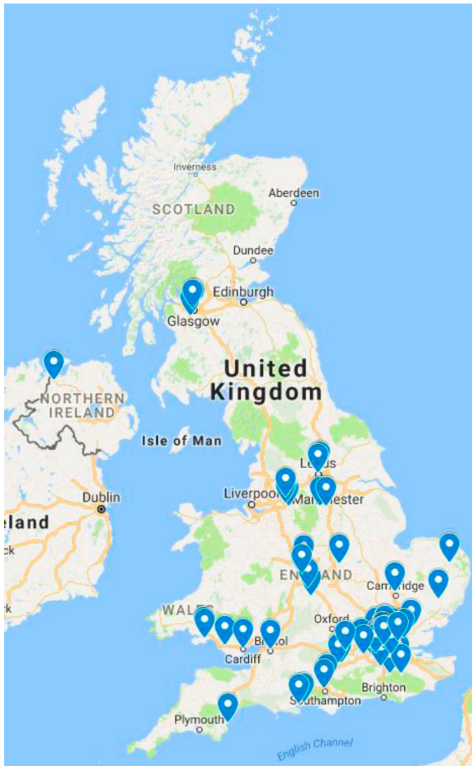
Figure 1. Map of UK stem cell clinics.

Corresponding with Turner and Knoepfler's (2016) findings in the USA, many UK businesses advertise Platelet Rich Plasma (PRP) therapies as a form of stem cell or stem cell-based therapy. PRP is a portion of the plasma fraction in autologous blood that has a high platelet concentration (Marx, 2001) and PRP therapy generally involves injecting this into an area of the body to promote tissue repair. Many businesses market PRP therapy by making claims to the ability of PRP injections to incite or promote stem cell action. While Turner and Knoepfler's study excludes businesses only marketing PRP therapies, we included them if PRP was framed as stem cell therapy, or if they made claims to stem cells as part of the marketing strategy (17 businesses used this approach).