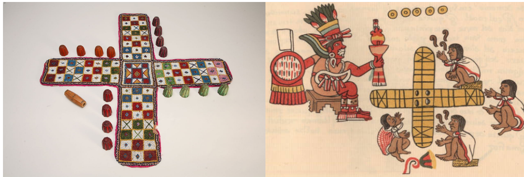
■ Figure 1 The game of Pachisi ( left ), and a depiction of the game of Patolli ( right ).

followed in this racing game. However, the set of plausible tracks can be greatly restricted by testing the playability of resulting rule sets, since some tracks would lead to unplayable games.