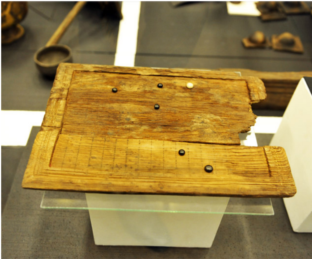
■ Figure 3 The Poprad game.