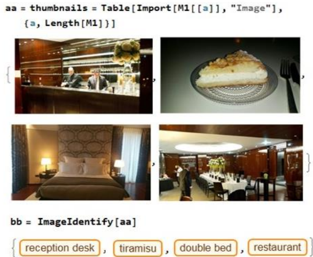
Figure 1. Part of code and output for ImageIdentify function.

studies (Donaire et al., 2014), Wolfram Mathematica provides more than 10,000 categories to classify objects. The adopted algorithm is based on a particular kind of Artificial Intelligence named deep learning , aimed at simulating the human learning process in order to make the system able to self-improve as soon as new information are available (Najafabadi et al., 2015; He et al., 2016).