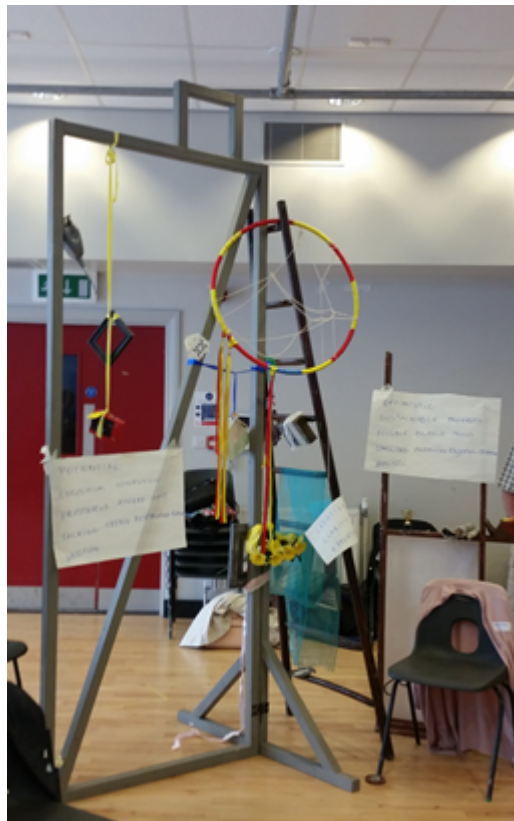
Figure 2: Using Encompass's theatre space for co-produced activities.