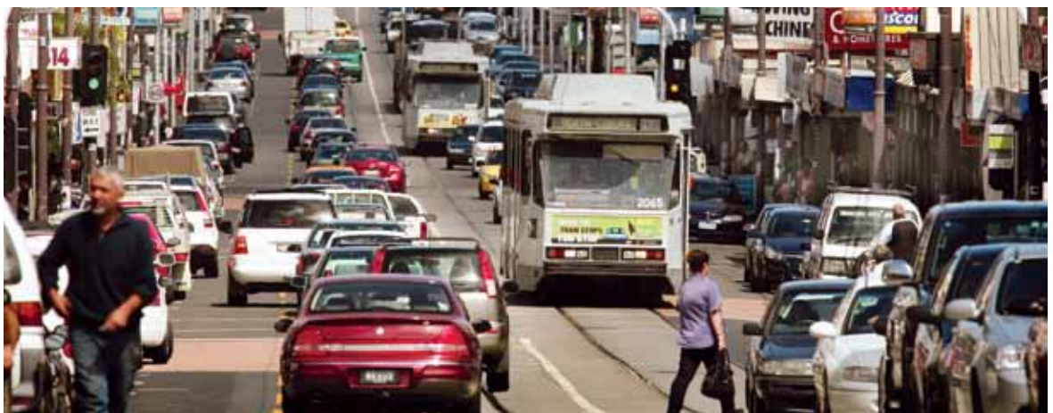
Sydney Road, Brunswick: Melbourne's inner suburbs have many attractions but pose adaptive challenges.

Designing energy and water infrastructure without understanding and incorporating wider system characteristics may limit infrastructure and community resilience. A focus on improving the robustness of technical hardware to climate change impacts may inadvertently restrict the capacity of end-users to adapt. Or it may create barriers to further learning – stifling needed innovation. Energy and water systems that foster interaction between end-users, managers, resources and technical hardware are likely to have greater capacity for self-organisation, learning and adaptation. What is unknown is whether certain responses to climate change can also reduce the resilience of energy and water systems over the long term. Such responses are considered 'maladaptive'.