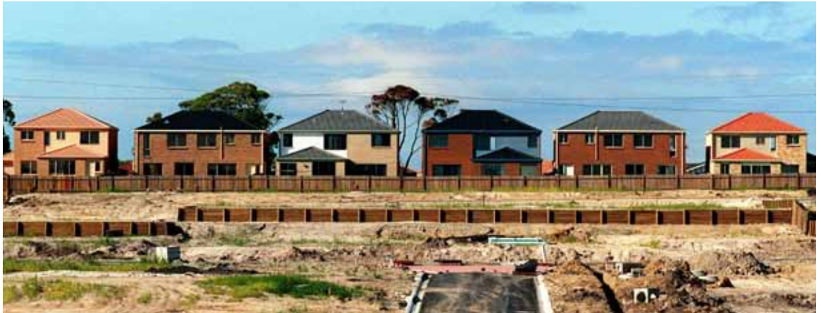
Adaptive challenges and opportunities #2: providing adaptive energy systems to new communities.