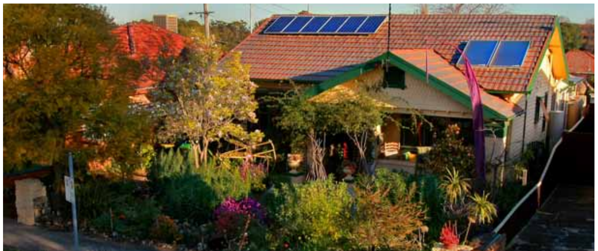
Adaptive challenges and opportunities #1: retro-fitting water and energy systems into older housing stock.