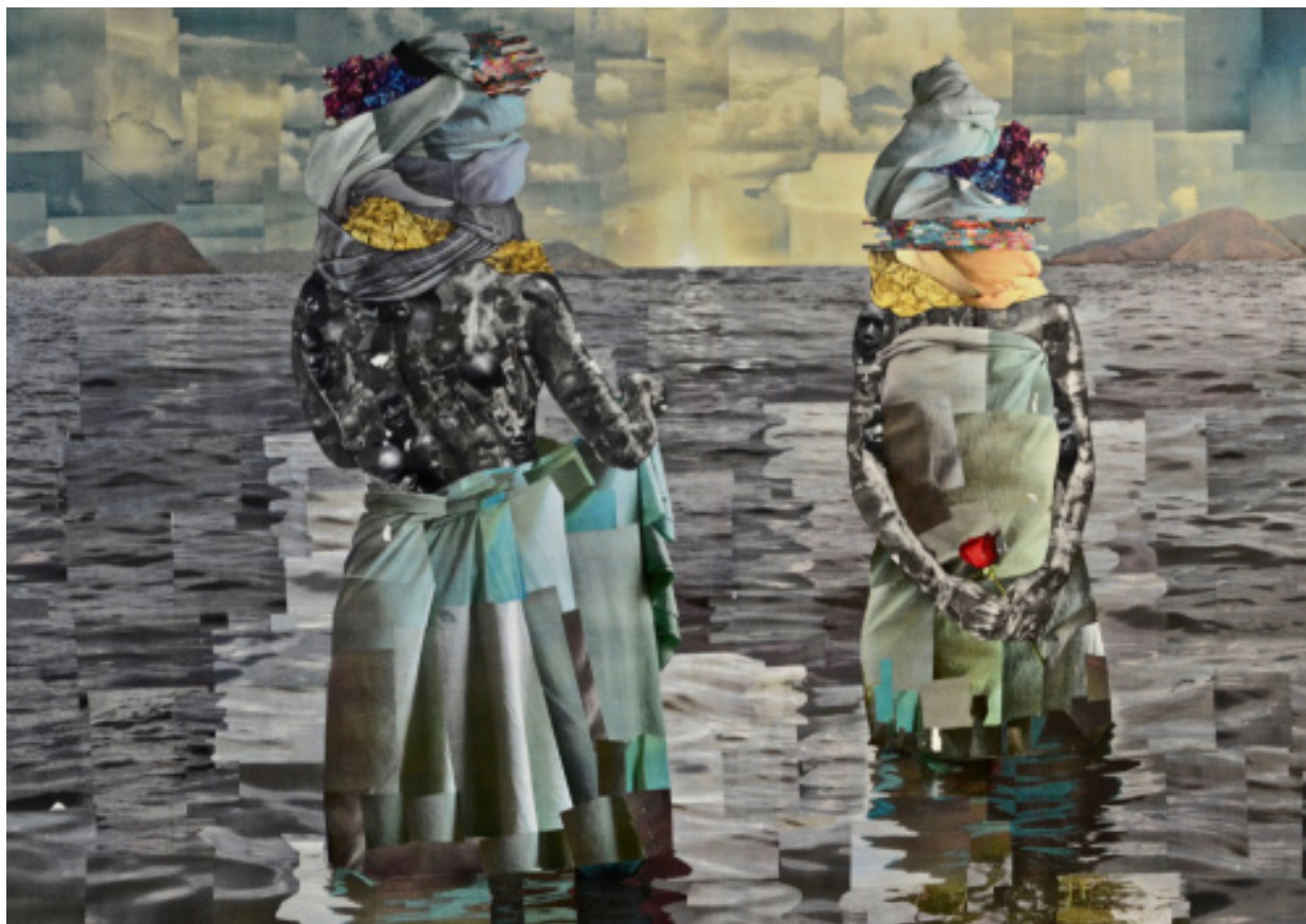
KUSA KUSA MASKI GAEL