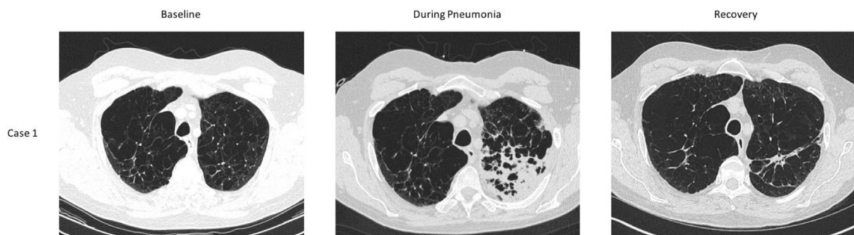
Fig. 1. Case 1 CT chest: pre- during- and post-pneumonia. There is consolidation superimposed on emphysematous changes in the left upper lobe during the acute pneumonia. The CT post recovery demonstrates scarring in the left upper lobe, with volume loss, as evidenced by anterior displacement of the left oblique fissure compared to the baseline CT.