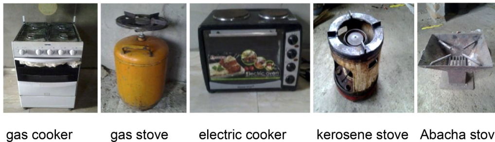
Fig. 2. Different stoves used in the study sites.