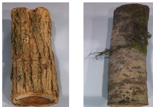
Fig. 1 Marabu (L) and aspen (R) woods

The barks were separated from the core woods, and the different samples were divided into smaller pieces, ~ 5 mm