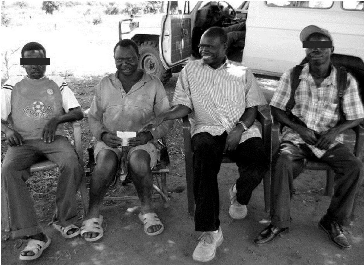
FIGURE 2. A former sleeping sickness patient (holding card) recovering from excessive hunger and fatness with some male relatives, in Nimule.