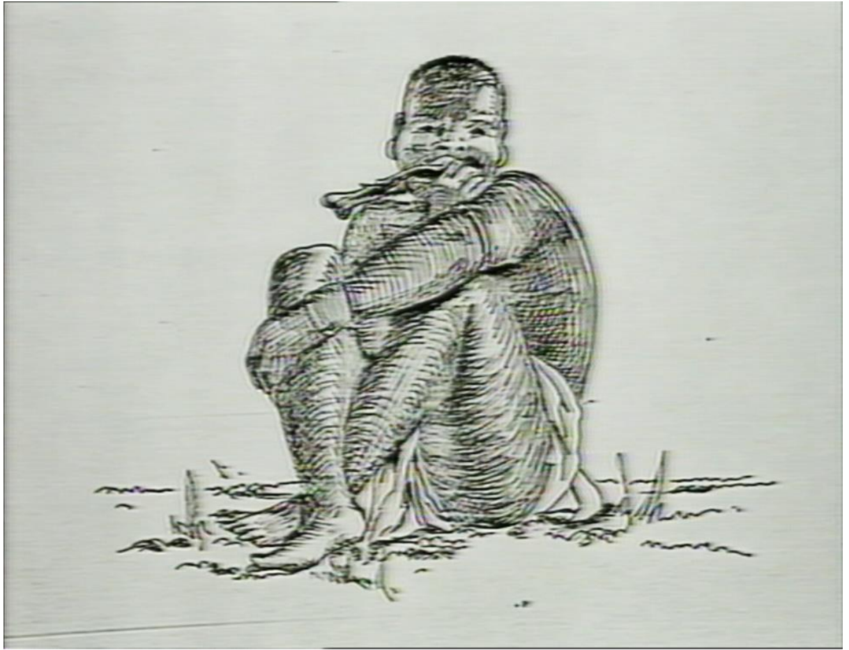
FIGURE 4. Illustration from nineteenth century West Africa depicting sleeping sickness patients as fat (Williams 1988).

Syndromic knowledge in Nimule was of course incomplete. Most people, including health workers (Palmer et al. 2014a), seemed to have low awareness of the severe neurological symptoms of sleeping sickness such as seizures, paralysis and difficulty walking. Additionally, the reproductive changes this disease can induce seemed to rarely feature in communal discourses, although I did not take a gender or life-course approach which might have been more sensitive to this. Further research on how syndromic experiences differ between genders, age and other social groups is needed, as is the after-effects of sleeping sickness and treatment on patients' physiology, lives and identities.