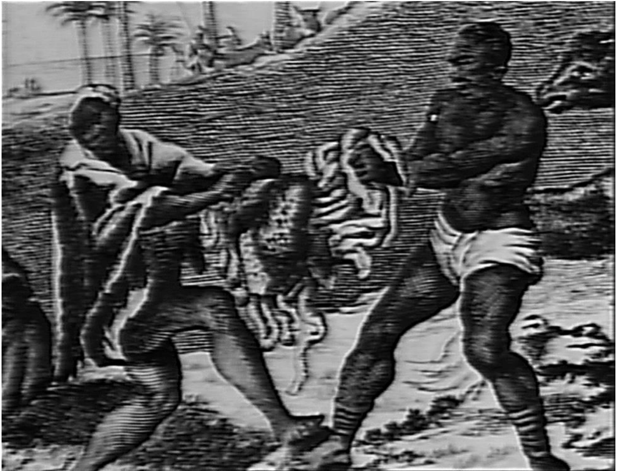
FIGURE 3. Illustration from nineteenth century West Africa of the ravenous appetite sleeping sickness patients were known for depicting patients fighting over raw intestines (Williams 1988). 6