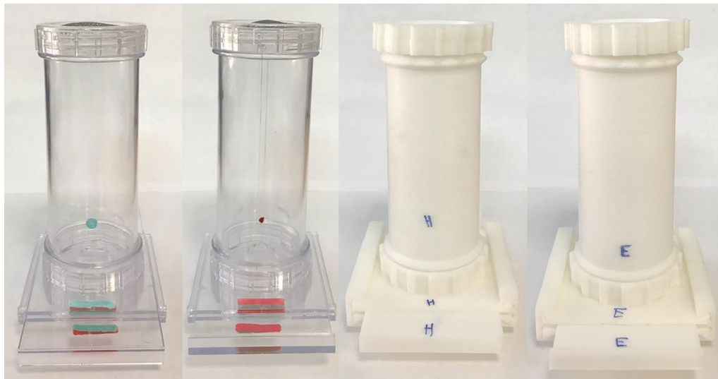
Fig. 2 Photograph of WHO bioassay parts (left) and equivalent 3D printed parts (right). E and H are used to denote the exposure and holding sides, respectively, whereas on the WHO bioassay parts red and green dots/lines are used

screens were too weak to be handled when printed without a border. Therefore, a 3 mm border was added to the CAD version of the mesh; this does not extend past the lip of the screw cap, retaining the same function as the original.