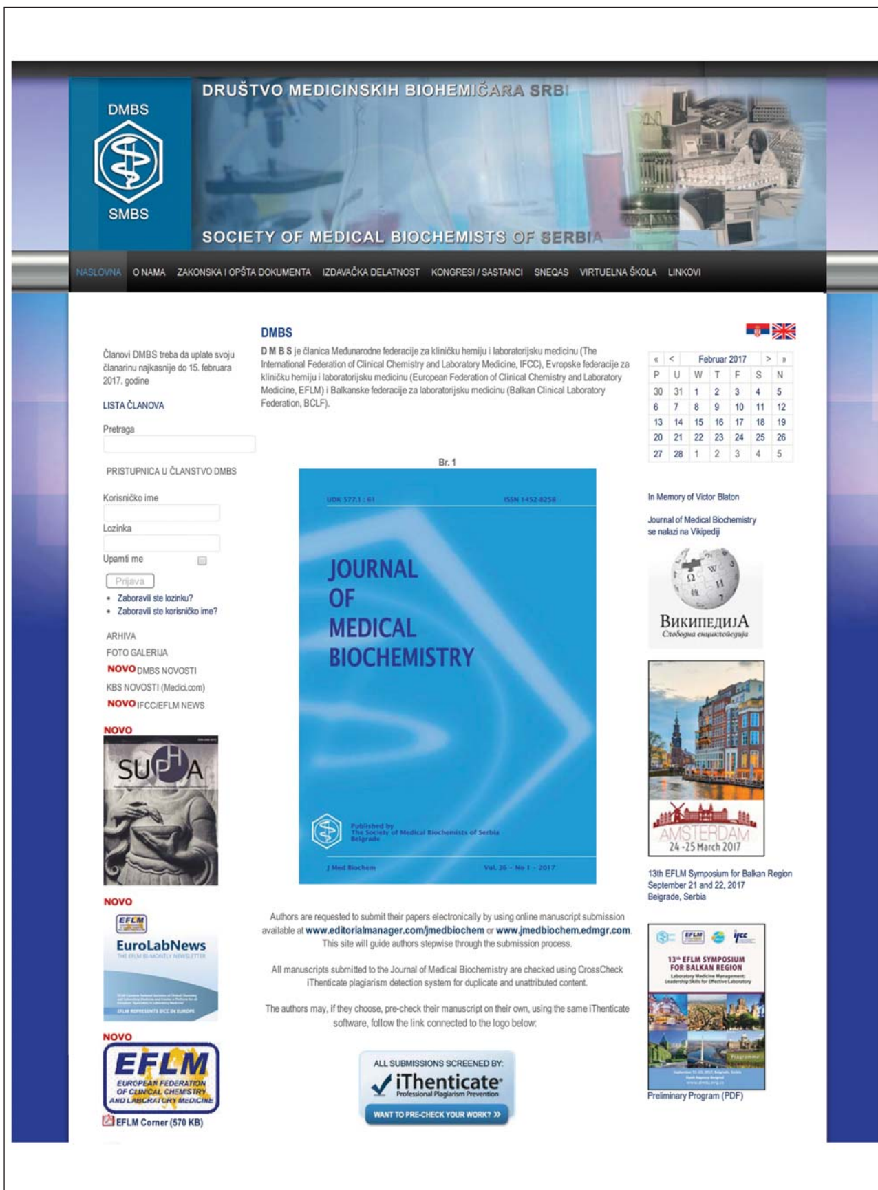
Figure 2 Cover page of the Society Medical Biochemits website (www.dmbj.org.rs)