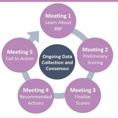
Fig 1. BBF 5 meeting process

Breastfeeding and BBF in Scotland: Breastfeeding rates in