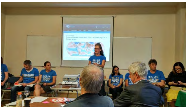
Left- 4 Sept. 2018, SELCE AGM, Mycenae House, Greenwich /

The overall research method is exploratory, conducted by participant observation and action. In many cases, the researcher is member of the steering group committee and/or is helping the logistics of different events, by attending or participating in events, meetings, workshops, helping with the editing of the draft Neighbourhood Plan (DNA), and organizing exchanges between the master students of the University of Westminster (modules "Public Realm" for DNA, "Place and experience" for Latin village case study) and local groups. In some cases, the researcher was soon asked to contribute, not only through volunteering for different events, but by taking charge of a project, and by sharing academic expertise, such as funding application, evaluation of the level of activities, social impact assessments, or community plan for a planning permission, etc.