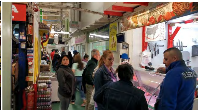
Left- 1 Nov 2018, Demonstration Latin corner on the day of a private meeting from Grainger developer over their case Right- 12 May 2018, Latin village, view inside and outside the market.