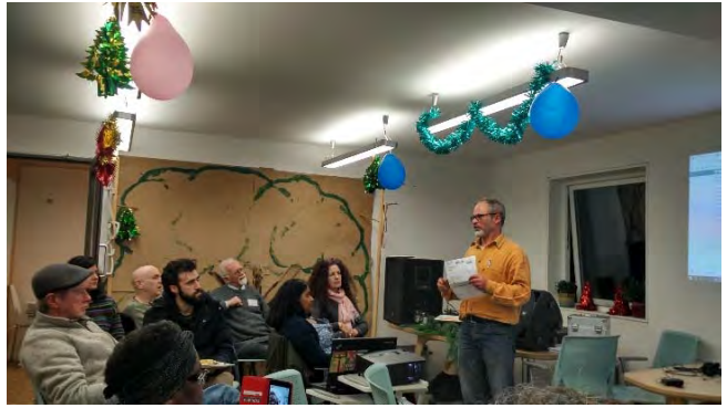
Left- 28 Sept 2018, London schools food conference, Conference with Charlton Manor, London City Hall / Right- 6 Dec 2018, Transition Town Brixton 10 year anniversary, Impact Hub, Pop Brixton