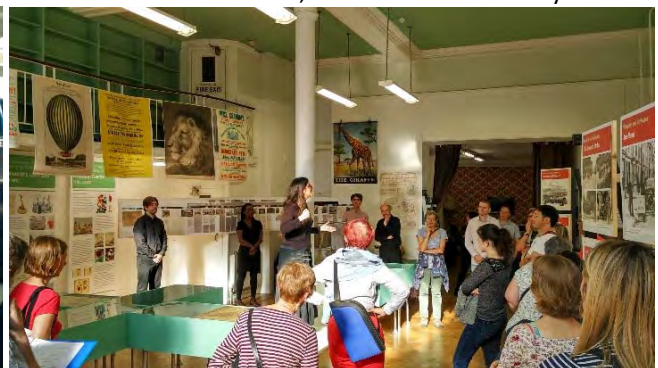
Right- 16-22 Sept 2018, Walworth history festival, Art Academy Newington (Walworth Society).