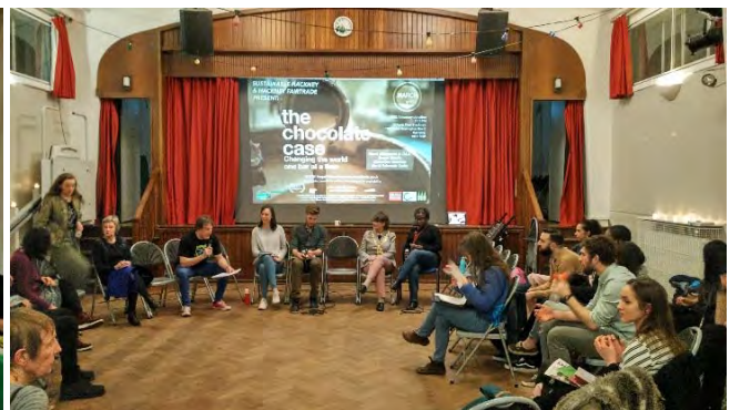
Right- 1 March 2019, Sustainable Hackney, Film event- "The chocolate case", St Paul's West Hackney Church