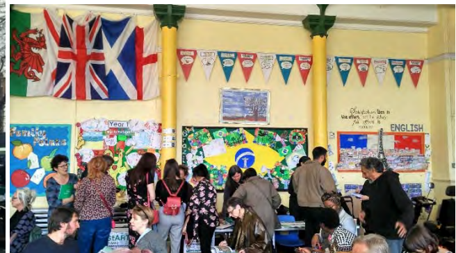
Left- 30 March 2019, Growing Communities Saturday market, St Paul's West Hackney Church / Right- 29 Sept 2018, Start AGM