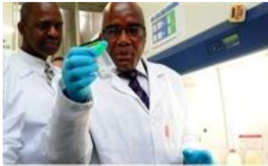
South African Health Minister Aaron Mokoalele Mofokeng demonstrating the new GeneXpert test.