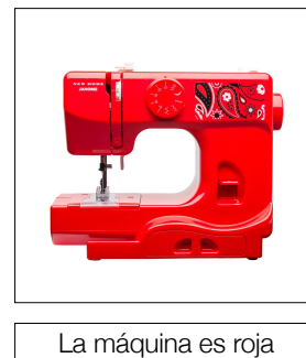
Figure 1: Example of an experimental item containing the cognate 'máquina'.

illustrating the meaning of the sentence, to help participants further understand the semantic meaning of the sentence, and to make the task more interesting (see Figure 1). Half of the sentences were experimental items that contained a cognate in which a different syllable is stressed than in its Dutch counterpart, either with a written accent (e.g., in Spanish: Los cardiólogos son inteligentes vs. in Dutch: De cardiologen zijn intelligent ) or without a written accent (e.g., in Spanish: El radiador es moderno vs. in Dutch: De radiator is modern ). The other half of the sentences were filler items that contained a cognate in which the same syllable is stressed in its Dutch counterpart, either with a written accent (e.g., in Spanish: Los números son romanos vs. in Dutch: De nummers zijn Romeins ) or without a written accent (e.g., in Spanish: La universidad es grande vs. in Dutch: De universiteit is groot ). The cognate always appeared as the second word of the sentence. For this paper, the filler items were not analysed.