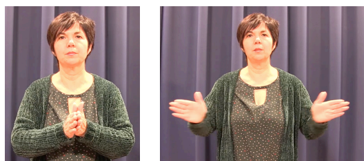
Figure 3: Stills from training video in AV-M condition showing an example of the metaphoric gesture.