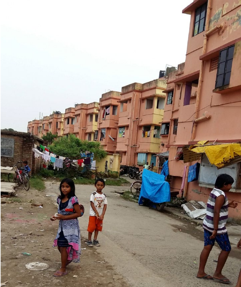
PHOTO 3 Kolagachia resettlement flats