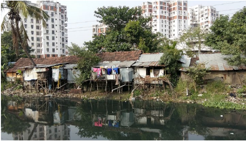
PHOTO 1 Churial Khal