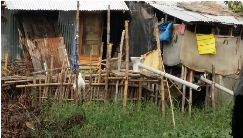
PHOTO 2 Churial Khal toilet