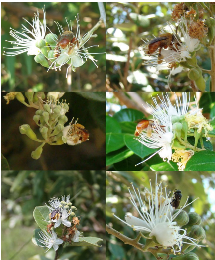
Figure 1. Pollinators and floral visitors of Couepia uiti in the Pantanal of Miranda-Abobral, Mato Grosso do Sul, Brazil. Females of C. spilopoda visiting flowers of C. uiti (upper and middle pictures). Female of Epicharis xanthogastra collecting nectar from the flower (bottom picture on the left side) and Nannotrigona aff. melanocera stealing pollen (bottom picture on the right side).

Centris spilopoda and E. xanthogastra visited flowers by landing frontally on the reproductive structures to access the hypanthium after bending stamens and pistil laterally. During the visit, they contacted the anthers with the ventral region of the meso and metasoma, as